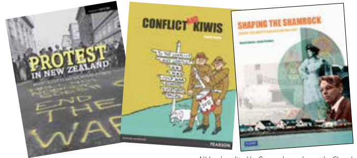
All books edited by Sue and page layout by Cheryl

little children's book with simple pictures, or a weighty history book including all manner of illustrations, photographs and diagrams. It can be black and white or full colour. So the cost of producing this type of book varies hugely, as does the level of editorial and design input. The editing and design cost will also depend on things like whether you require assistance with permissions (e.g. copyrighted photographs), how much fact checking is needed, and how highly designed you want your book to be (e.g. do you want all the photos bunched in the middle, or do you want the text designed around the images, with leader lines, vignettes, etc). It wouldn't be helpful putting in a price range for this package, just get in touch to tell us all about it and we'll take it from there.